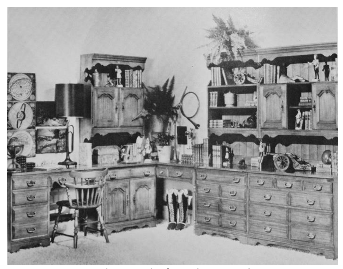
1971 vintage ad for Consolidated Furniture

Over the succeeding decades, the company merged with other operations and did business as Magnavox, Cherokee Furniture, Consolidated Furniture and Singer, with furniture becoming the principal product.