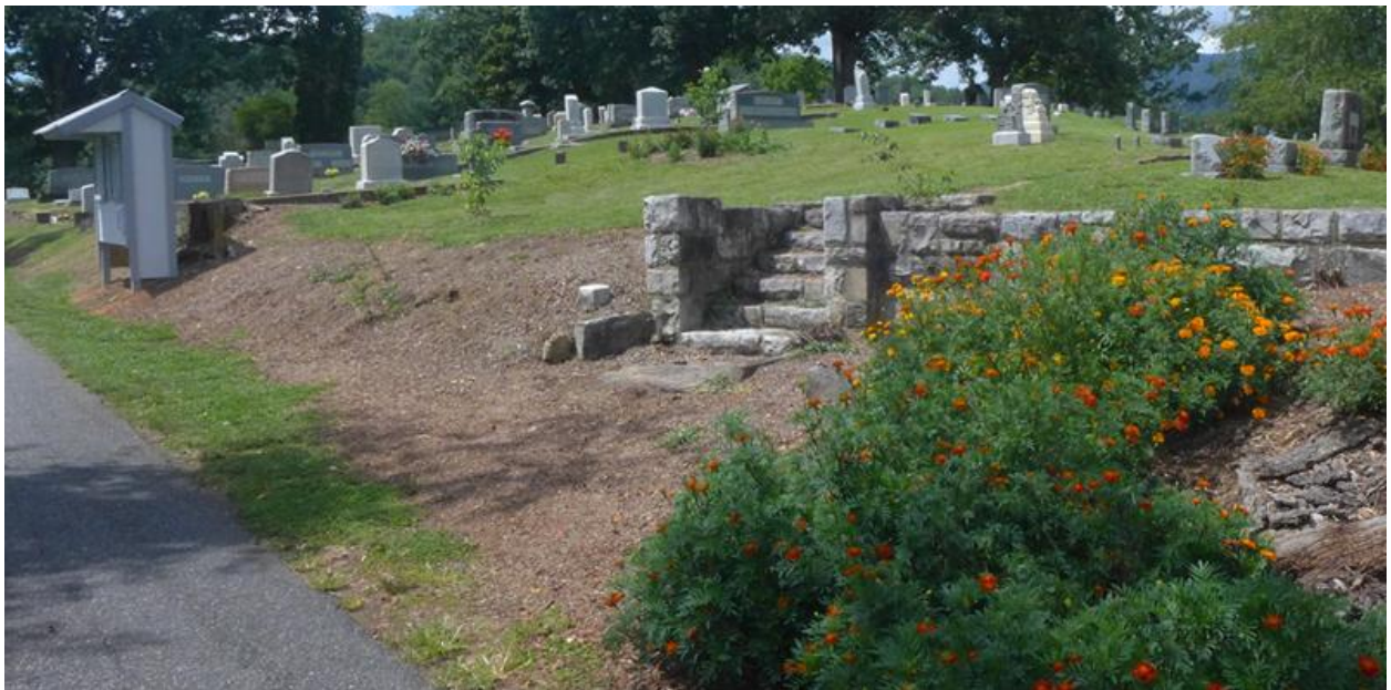
Marigolds near the entrance (and information board at left)