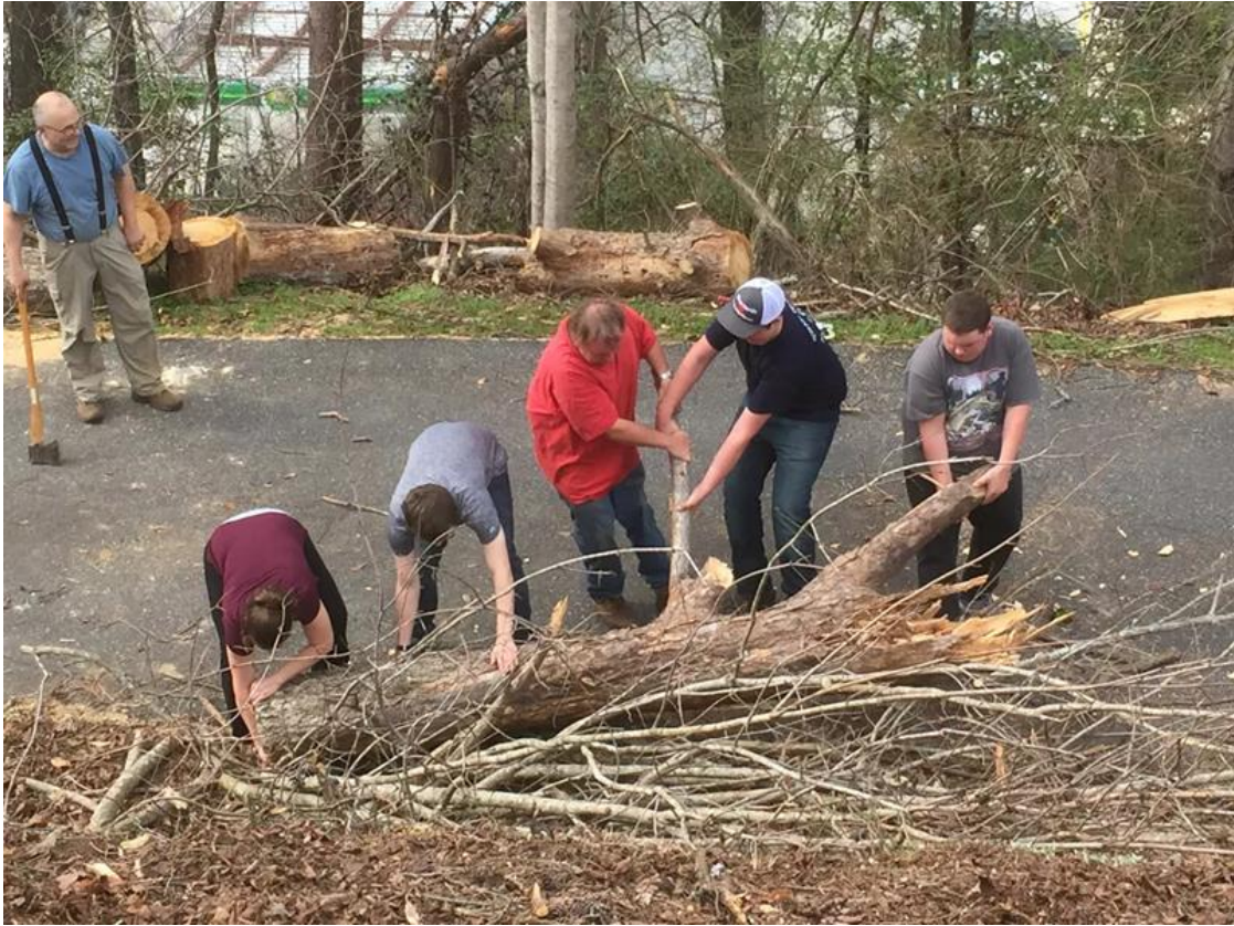
JROTC cadets and a volunteer helper removing tree from the road