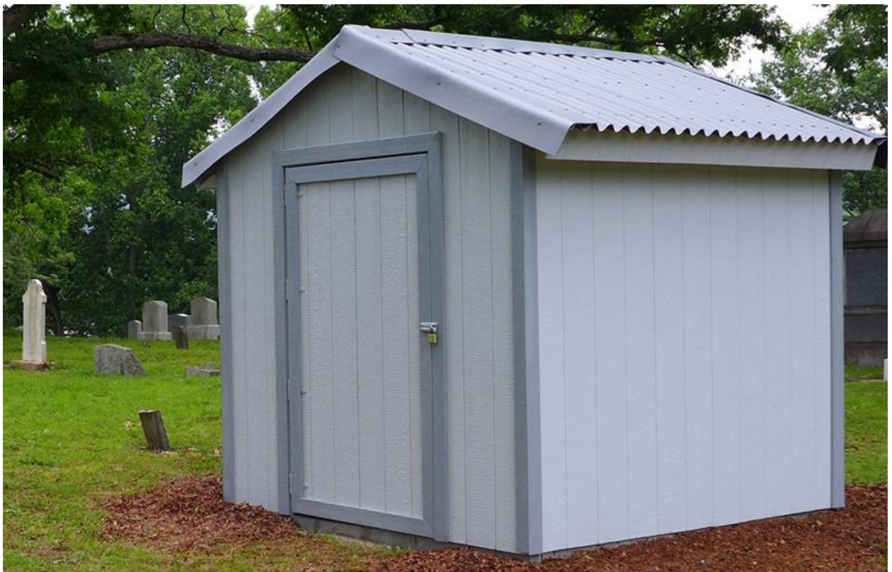
New tool shed