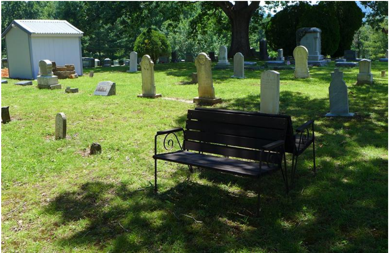
New benches (and tool shed with motion sensing light attached in background)