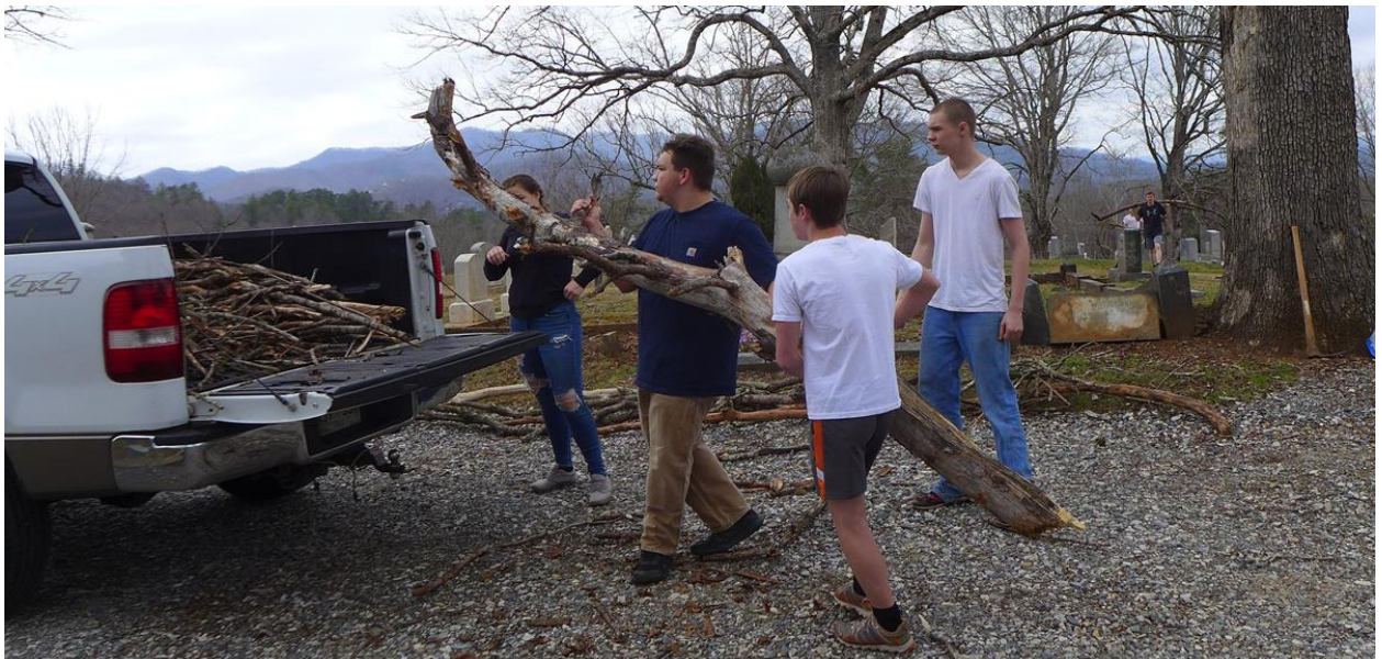
JROTC cadets loading limbs to be moved offsite