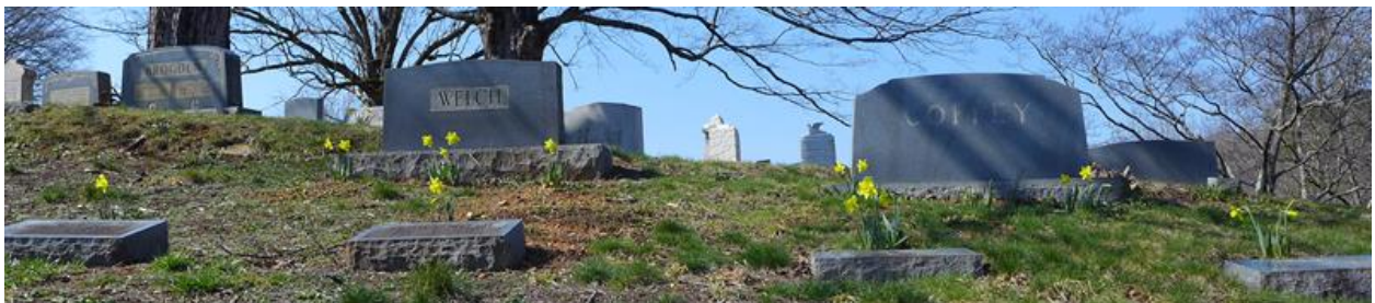
FBCC-planted jonquils at the Coffey and Welch family plots