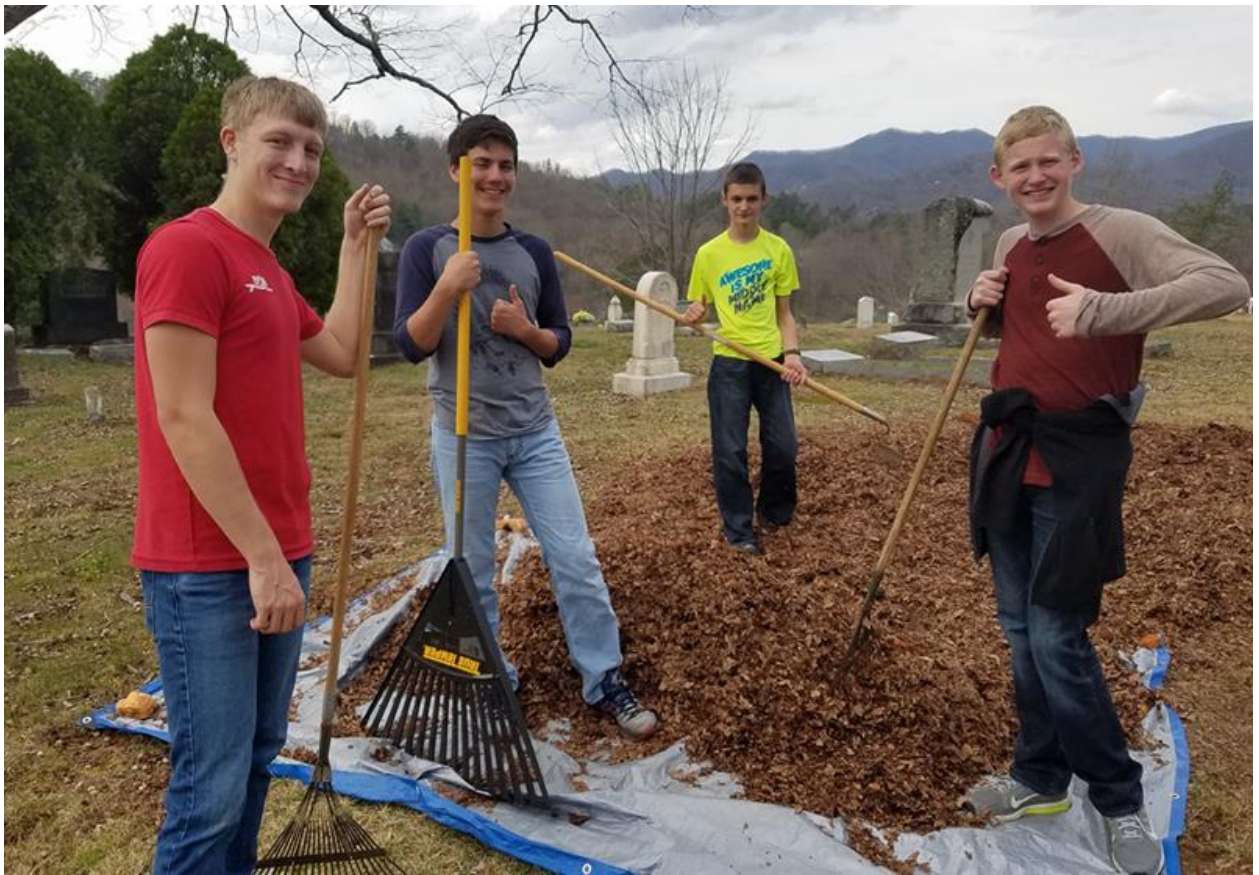
JROTC cadets raking mulched leaves onto tarp for transport