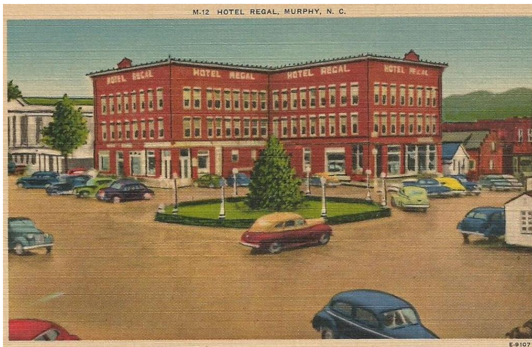
Middle 20 th century postcard of the Regal.

He had a brick yard in Murphy, North Carolina. He made his own brick and was a good brick mason. He built the first brick buildings in Murphy. One was torn down in the 1980's on the square. It was the old Regal Hotel.