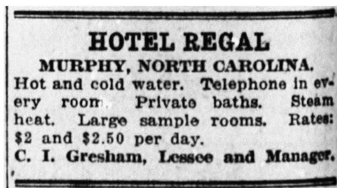
(Asheville Gazette News, February 22, 1915)

The presence of a telephone in each room noted in the 1915 Gazette-News ad is striking. A Christmas Day, 1921 edition of the Asheville Citizen-Times noted that the Regal Hotel, constructed of pressed brick and native marble, had 65 steam heated rooms, and electric elevator service. An ad from the next decade (below) indicated that the hotel had been renovated, with fewer rooms.