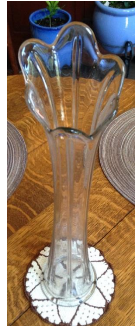
D.K. Collins store, on the southeast corner of the square (Bryson City Centennial); Pressed glass vase from the store purchased by Ora Hughes Dougherty

D. K. COLLINS, DEALER IN General Merchandise AND COUNTRY PRODUCE. Customers will find our stock complete, comprising many articles it is impossible here to enumerate, and all sold at moderate prices.