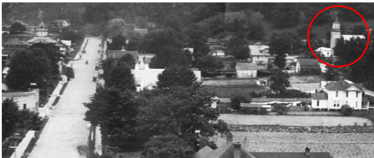
View from the BC Cemetery. The photo likely dates to 1910-1920.