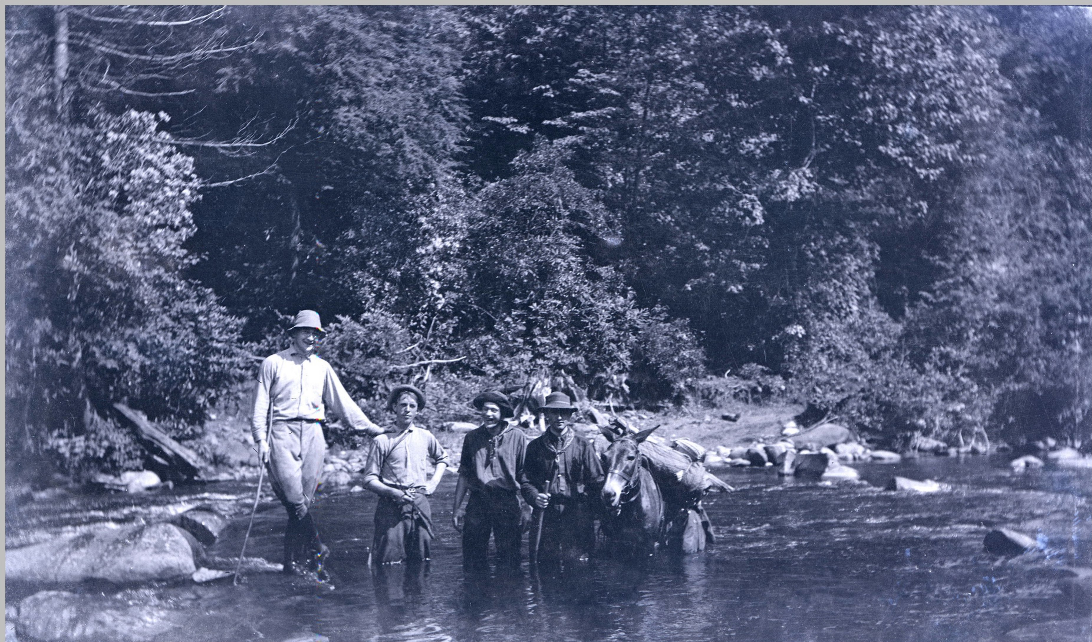
Four campers and their load bearer at the first ford on Deep Creek above the Bumgarner Bend. The original Deep Creek trail followed the creek, with 18 fords between the modern parking area at the trailhead and the famous Bryson Place.