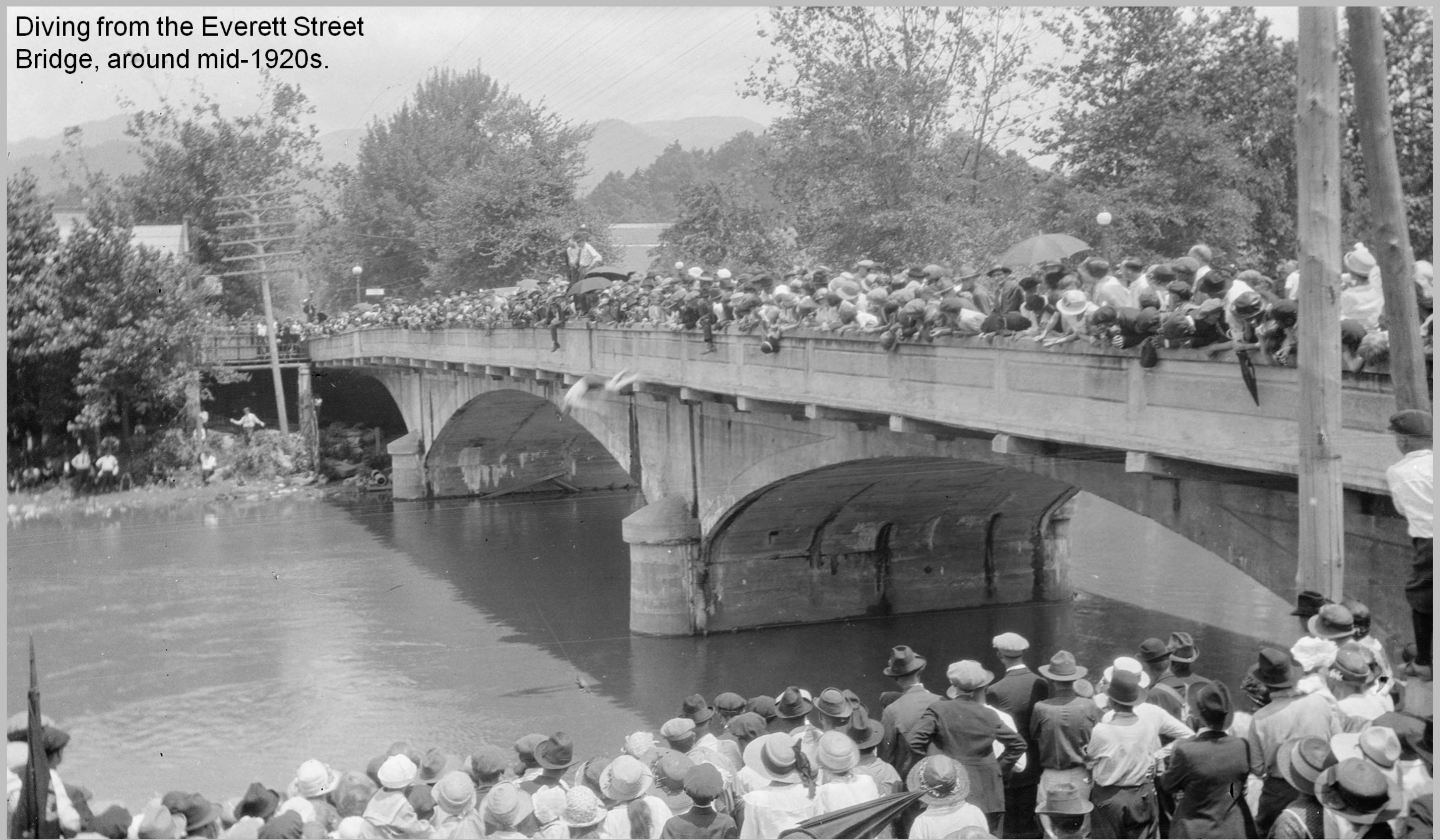
Diving from the Everett Street Bridge, around mid-1920s.