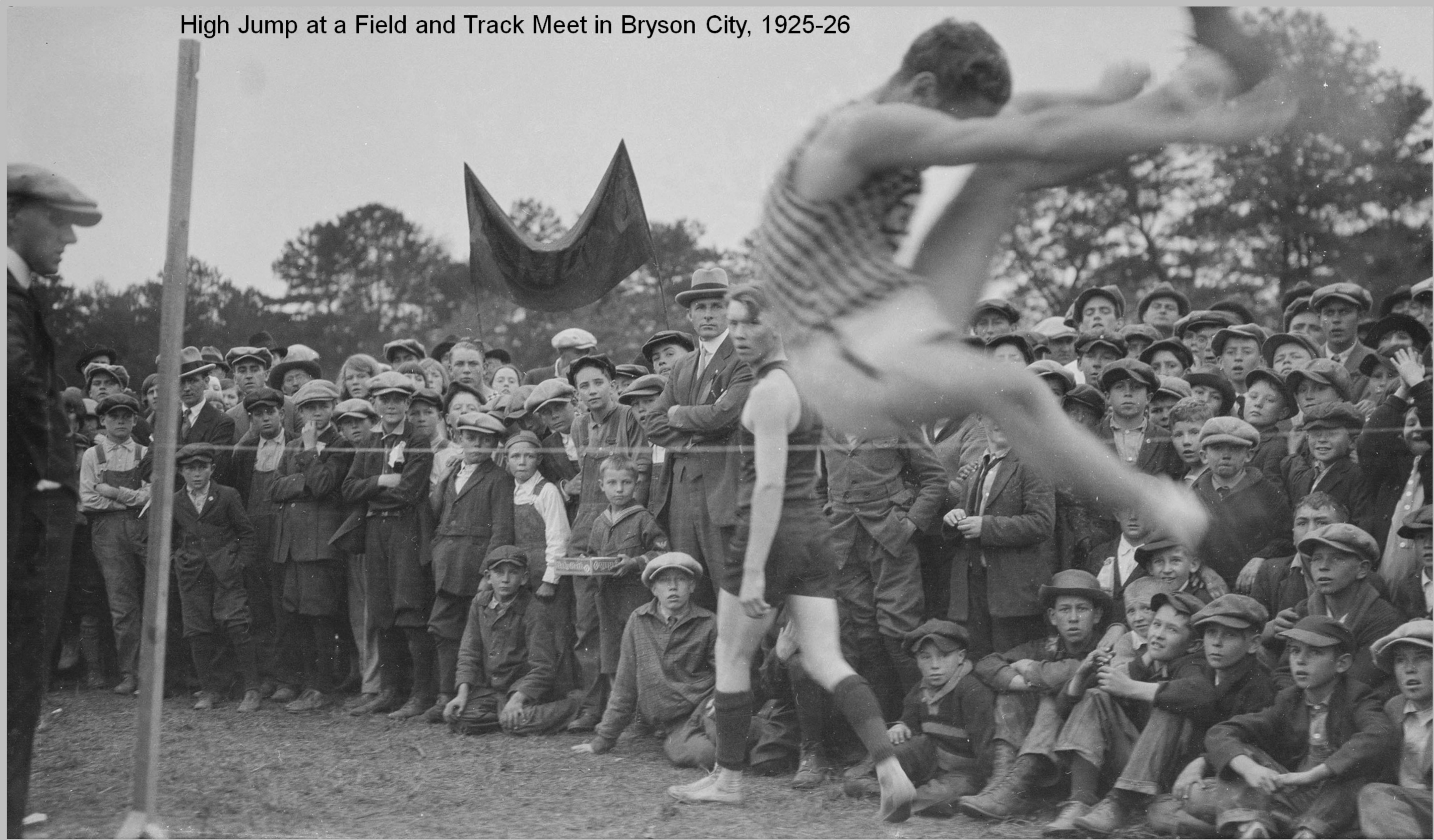
A Bryson City High School jumper clears the hurdle as an Almond High jumper who had just cleared the same height looks backward on his competitor.