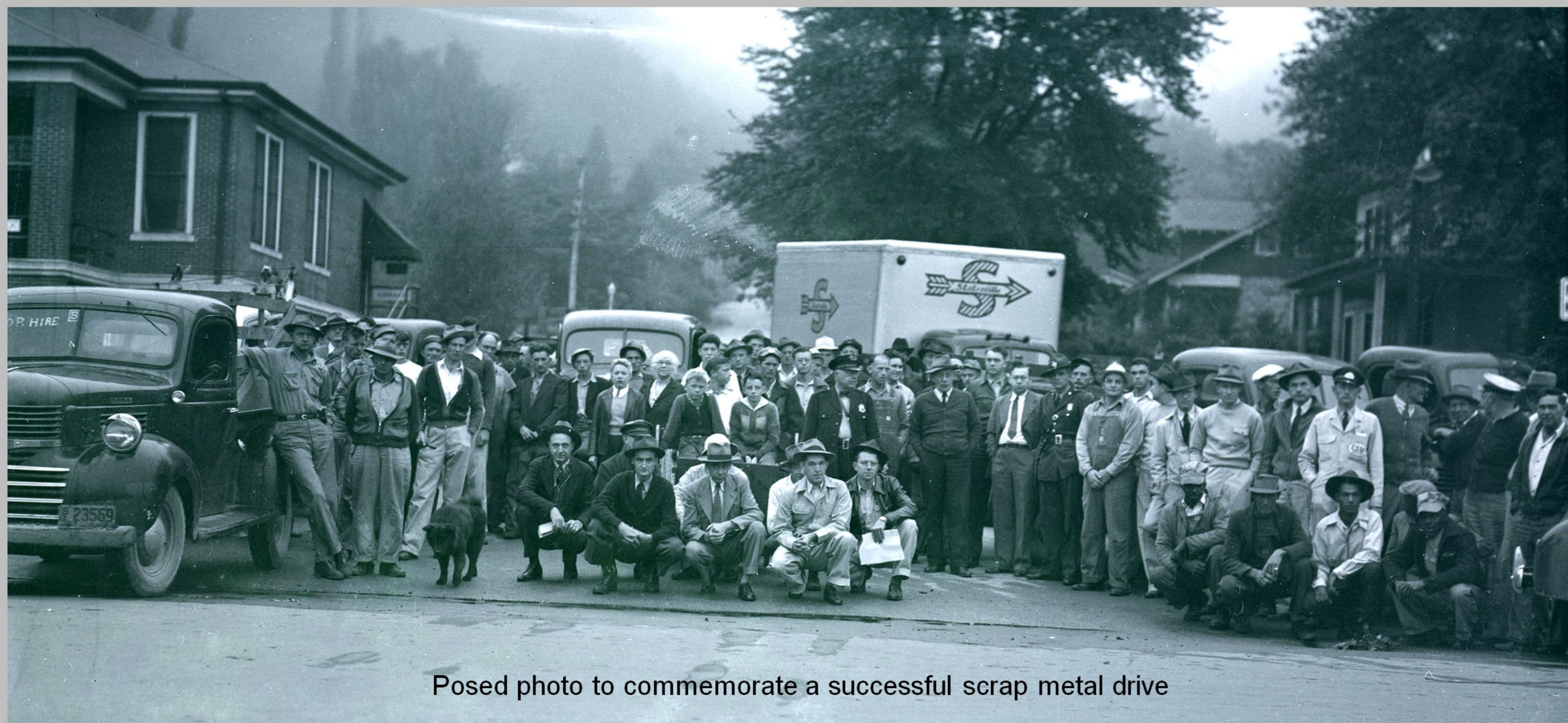
Posed photo to commemorate a successful scrap metal drive