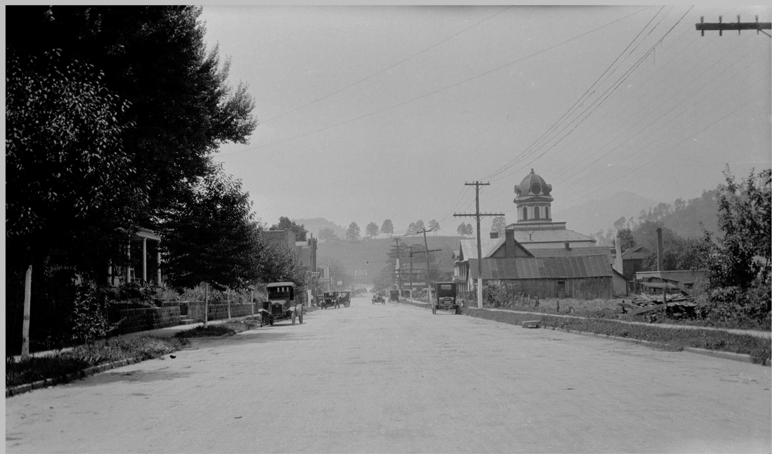
Looking west down Main Street, a century apart.