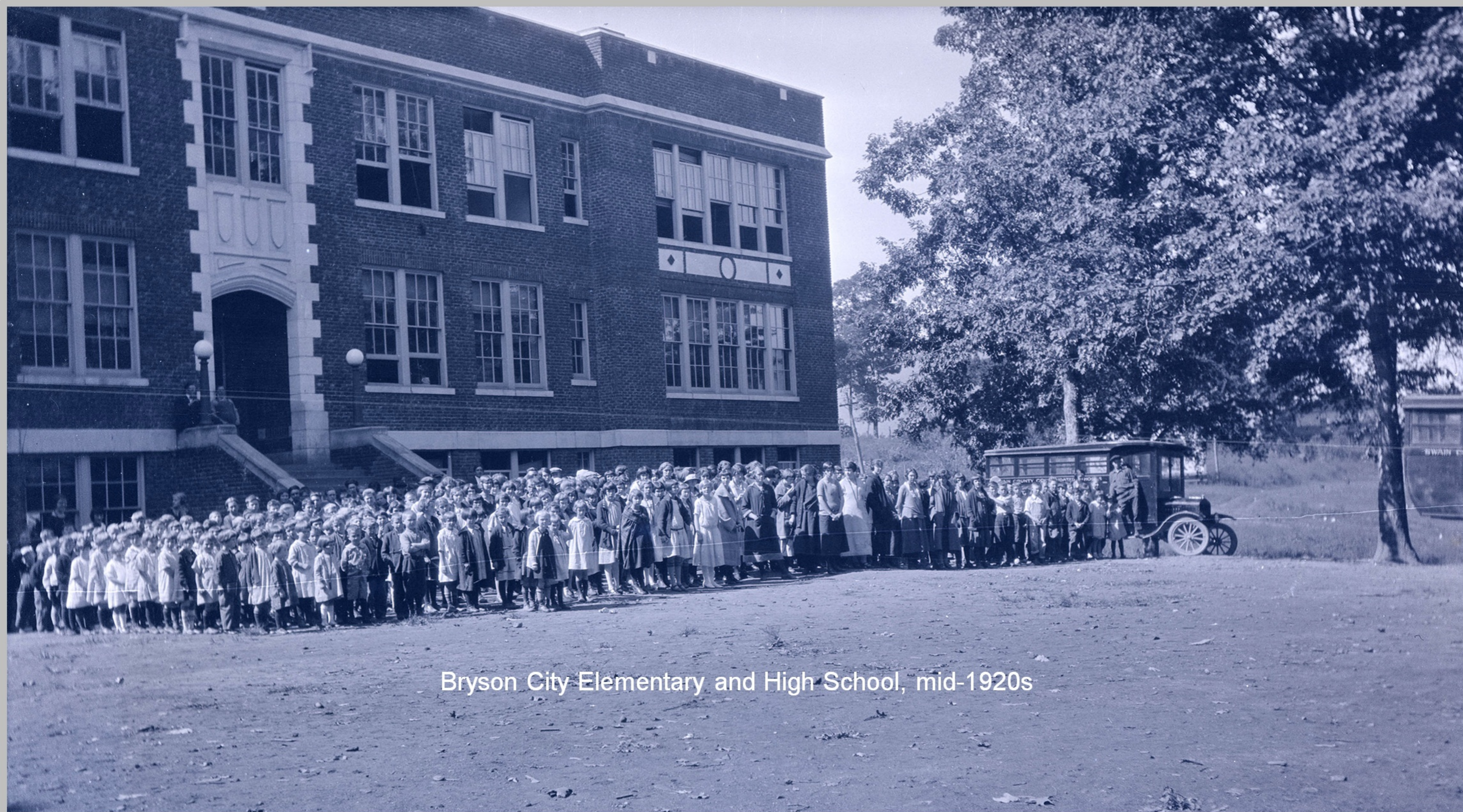
Bryson City Elementary and High School, mid-1920s

The lovely Bryson City School building was first used in the fall of 1923. At the time this photograph was taken, the building was used by all eleven grades. In 1929, a second building would be erected beyond this building to serve as Bryson City High School and later Swain County High, while this building was used for elementary school. Its auditorium served as the venue for graduating ceremonies over the course of three generations.