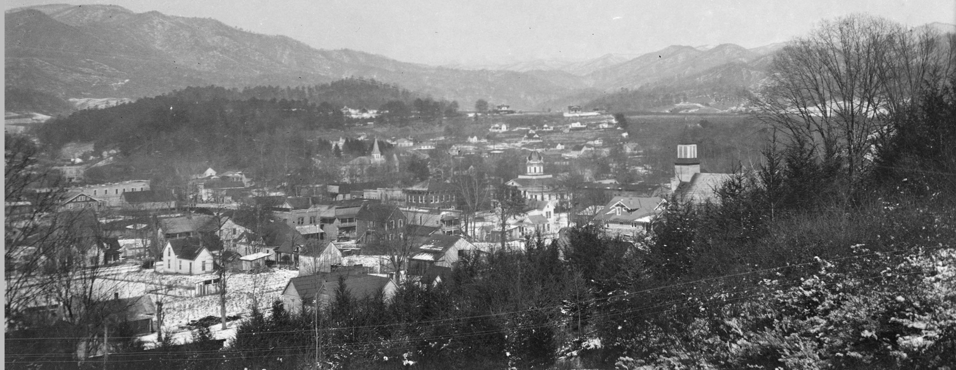
The building with the steeple on the right was the Academy, erected by D.K. Collins on town lot 32 in 1888. The lower floor was used for school and the upper floor for the Masonic Lodge. It stood just west of the current Marianna Black Library. The steeple further in the background, just left of center, was the original First Baptist Church location.