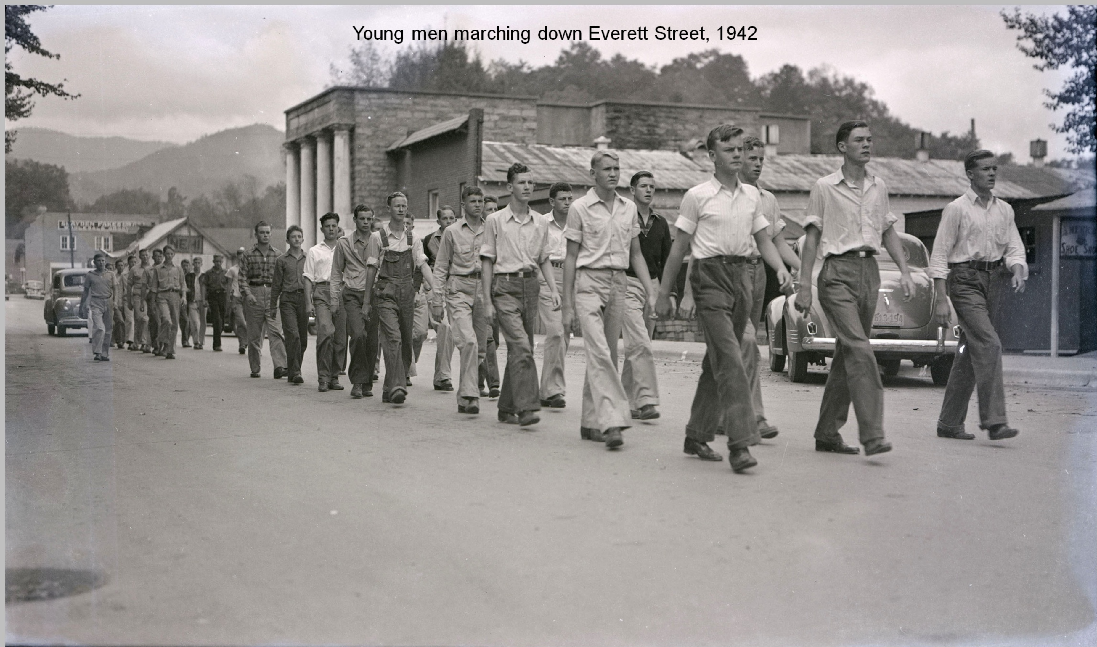
These young men marching in formation down Everett Street in 1942 may have been early volunteers for the war effort.