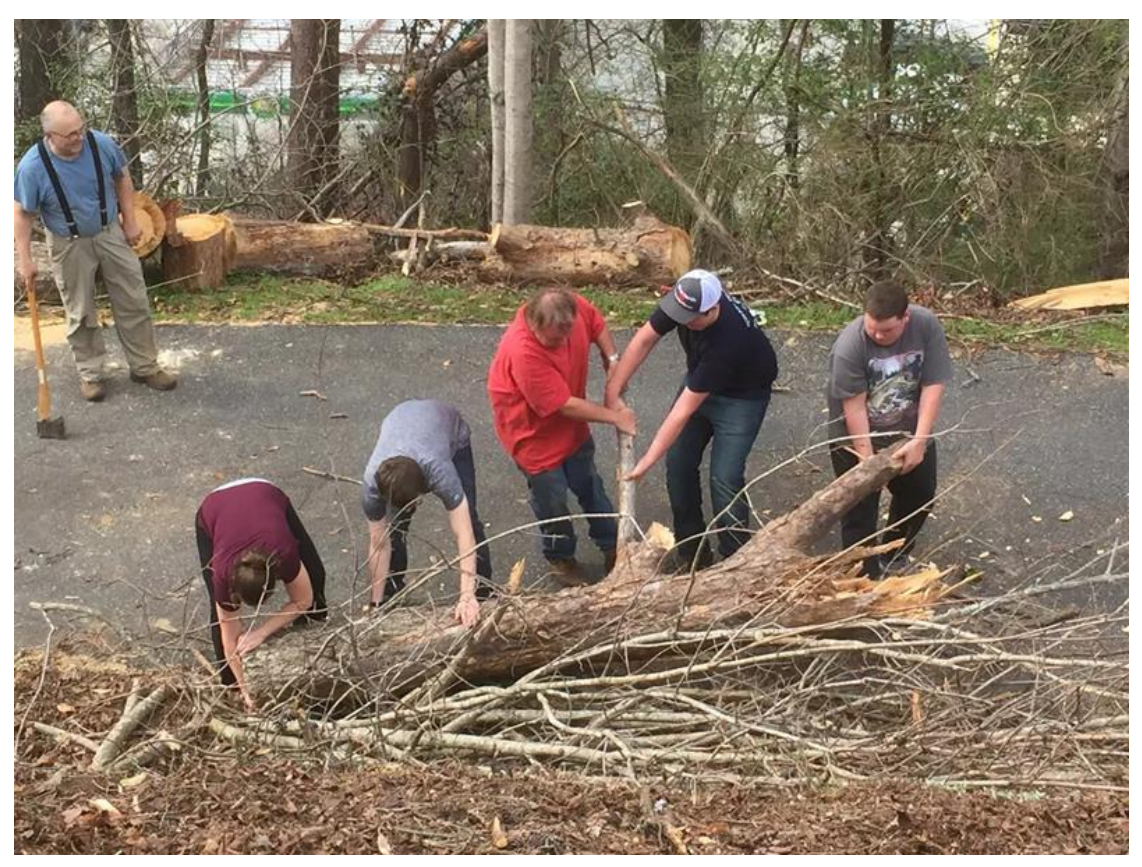
JROTC cadets and a volunteer helper removing tree from the road