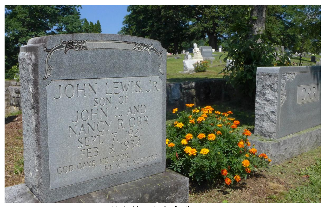
Marigolds at the Orr family graves