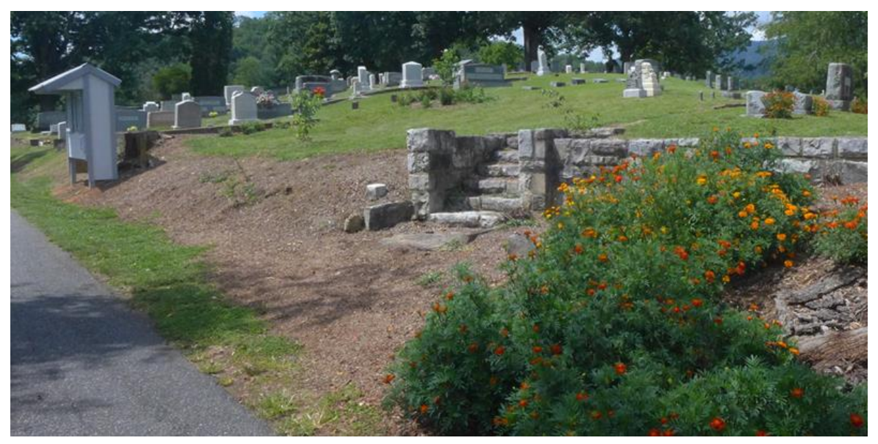
Marigolds near the entrance (and information board at left)