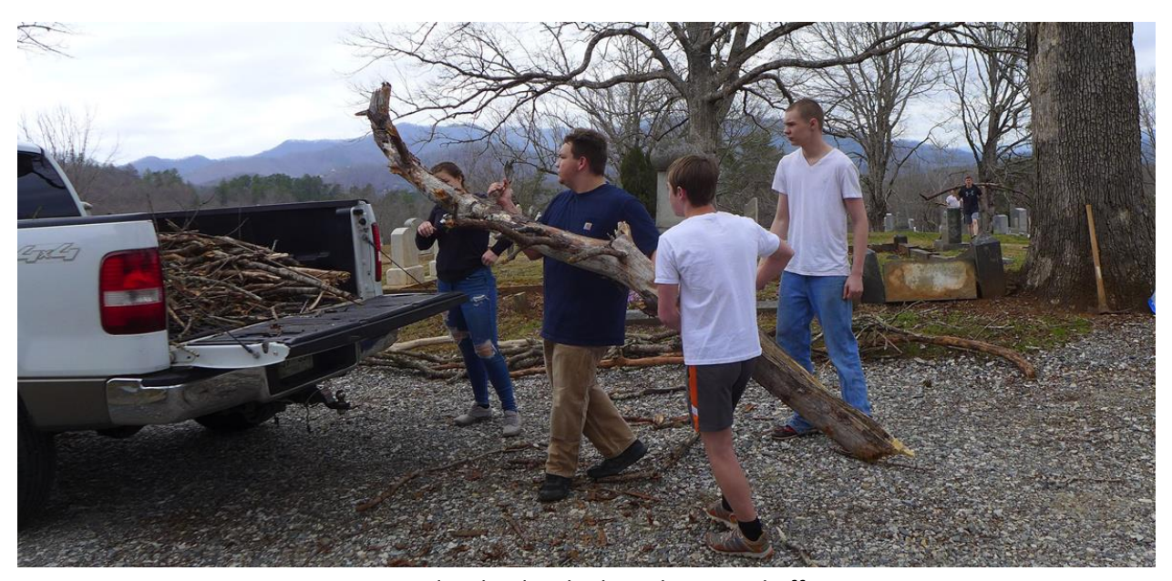
JROTC cadets loading limbs to be moved offsite