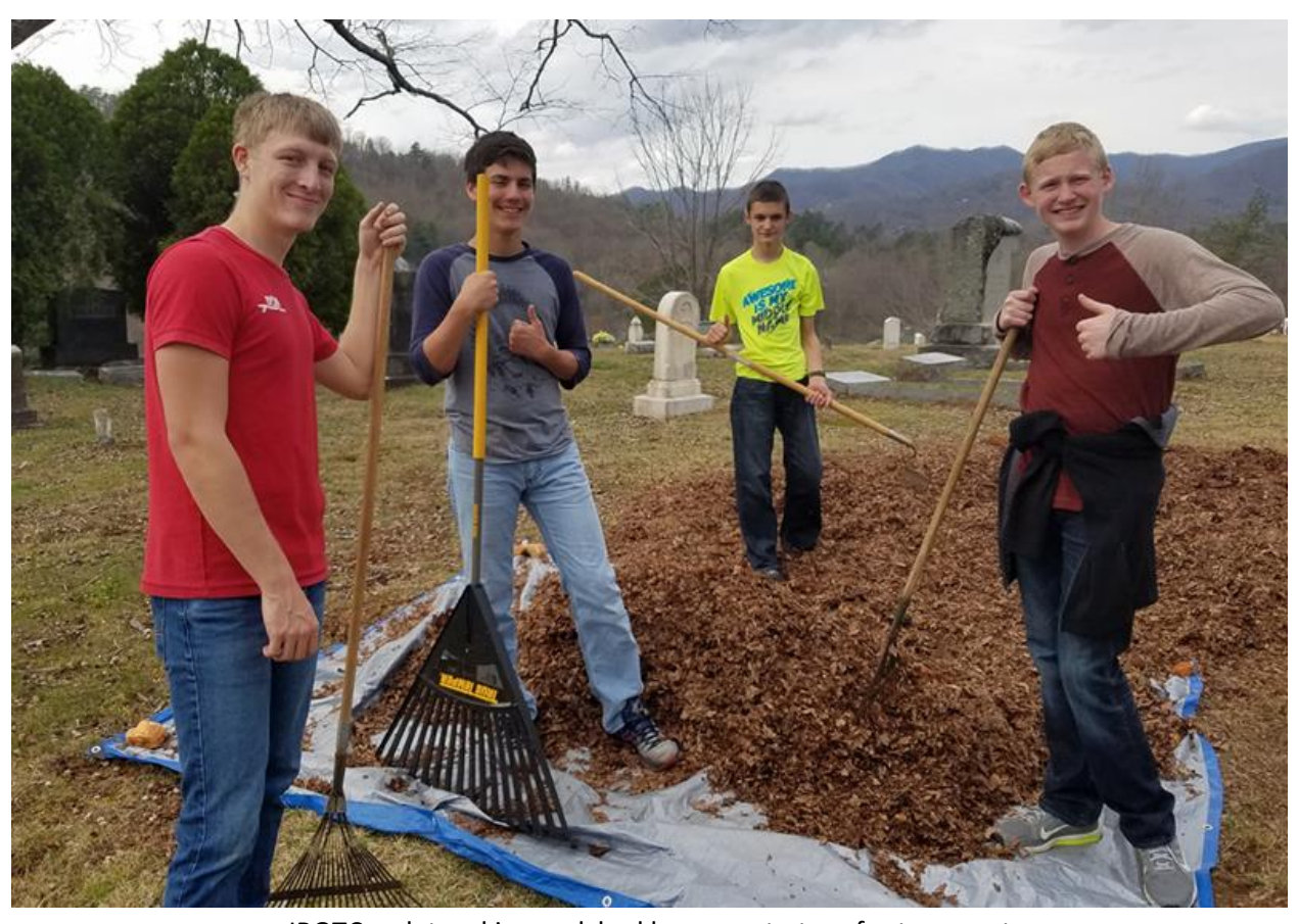
JROTC cadets raking mulched leaves onto tarp for transport