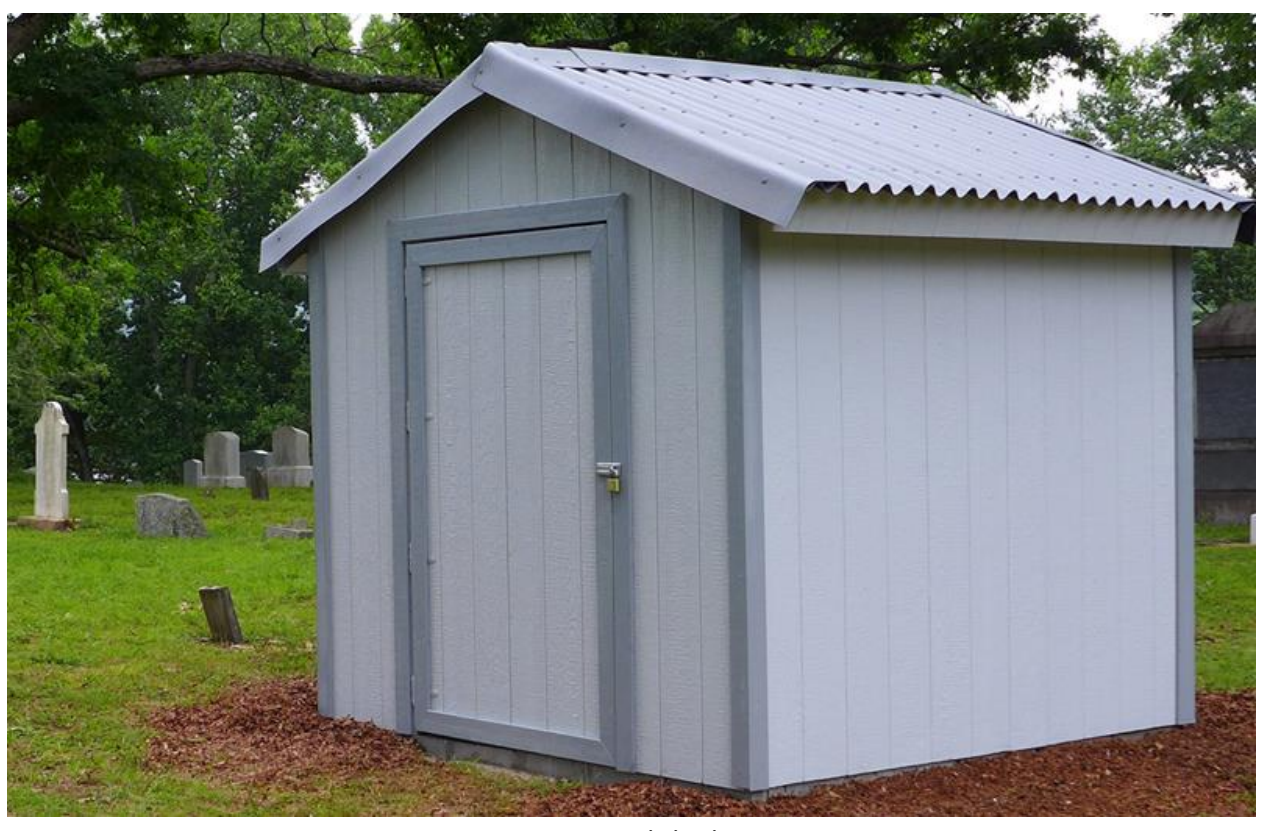
New tool shed