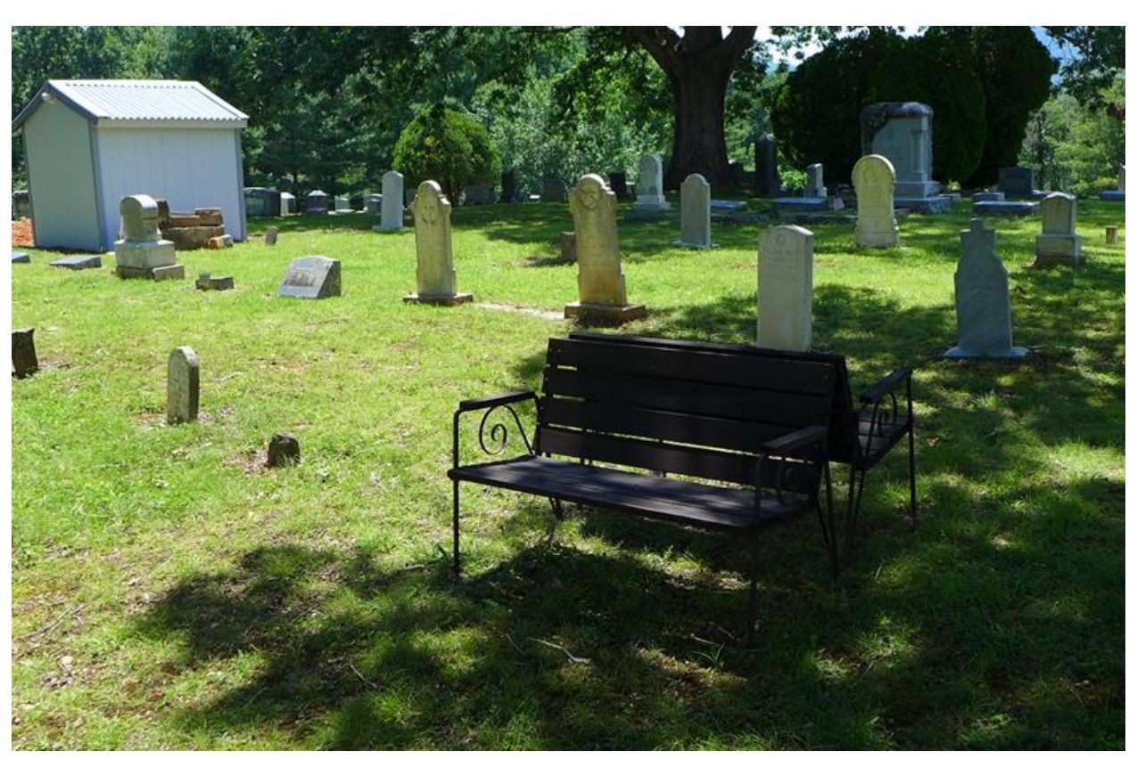
New benches (and tool shed with motion sensing light attached in background)