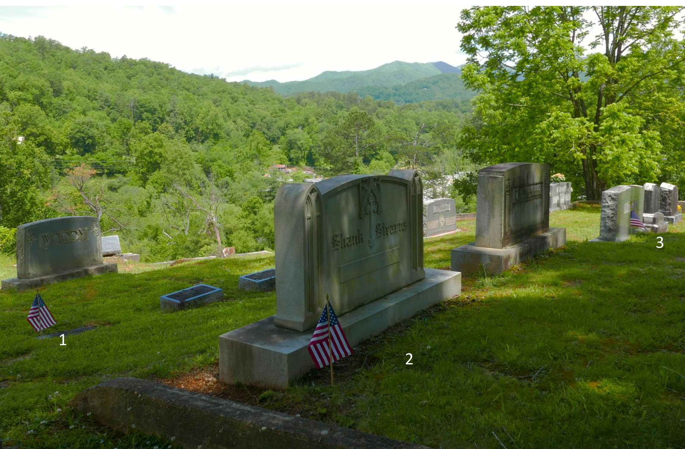
1. Queve Woody, III (Vietnam) 2. Jeremiah Shank (Civil) 3. Walter Nichols (WWI)