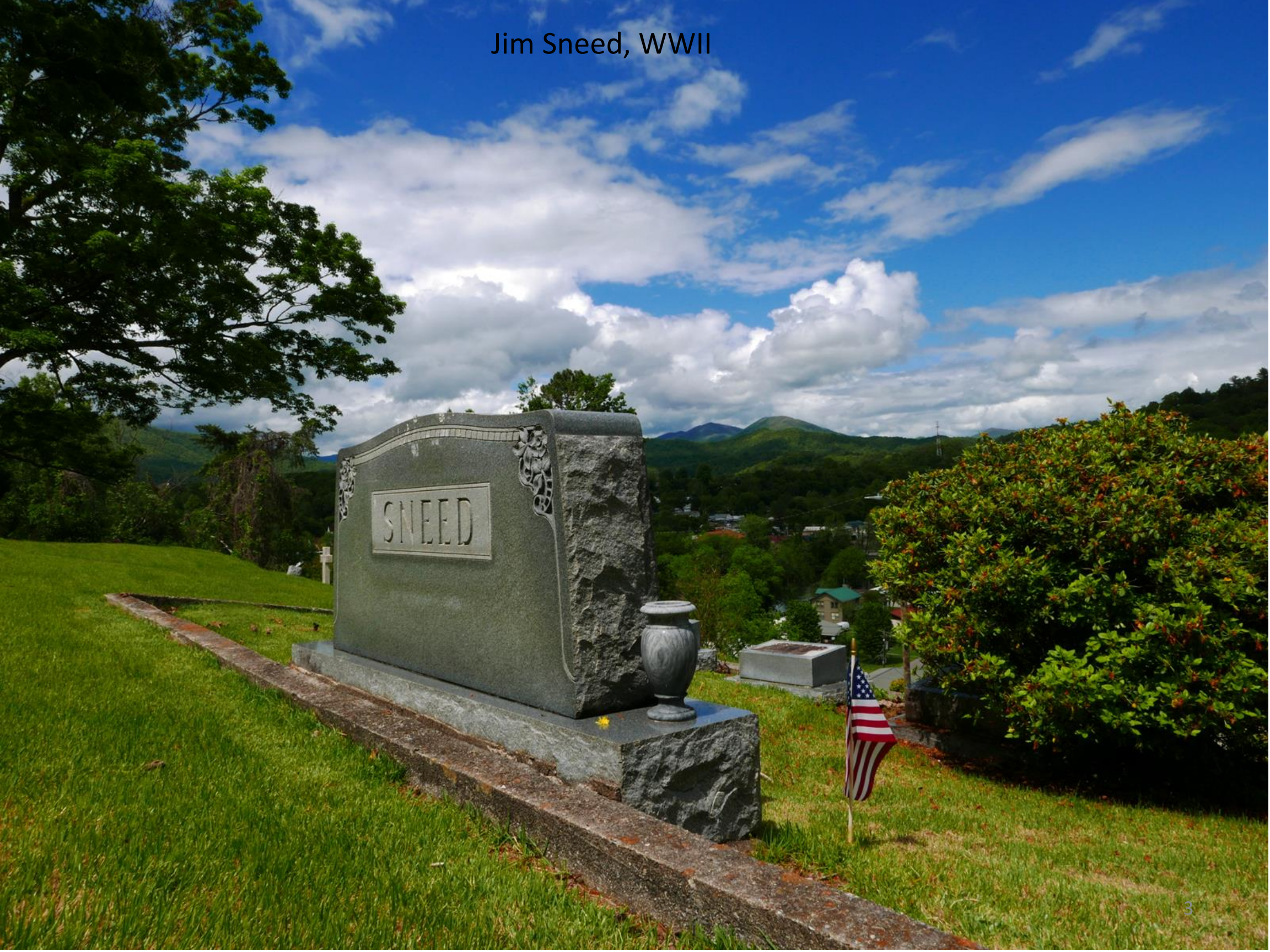
Jim Sneed, WWII