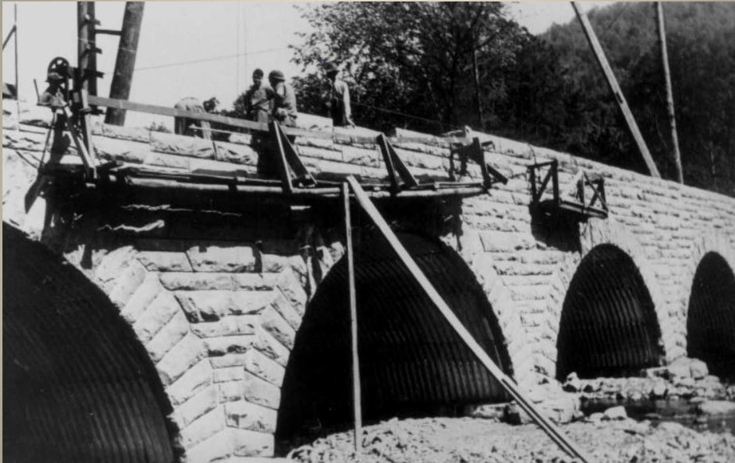
Construction of the Elkmont Bridge by the CCC