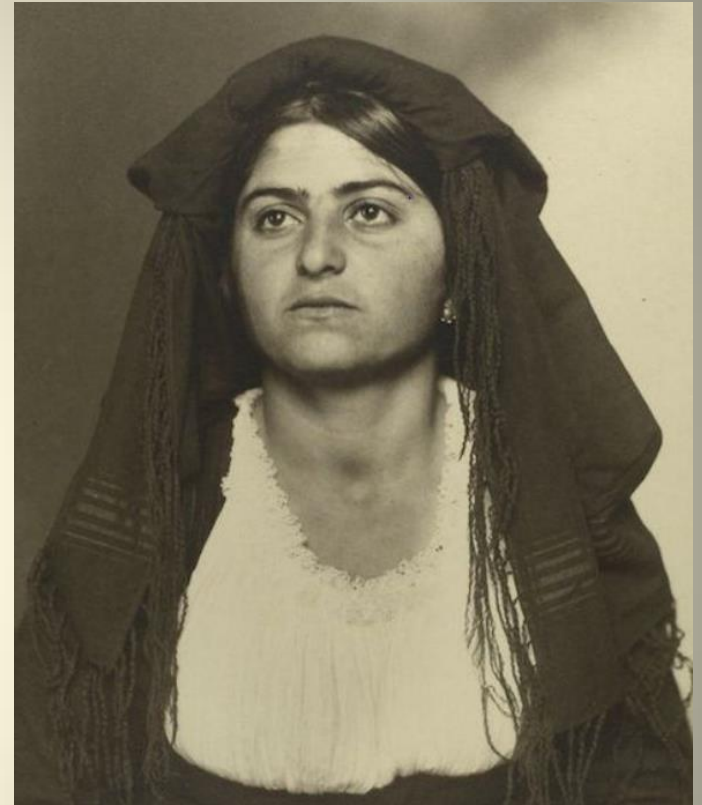
An Italian Female Immigrant