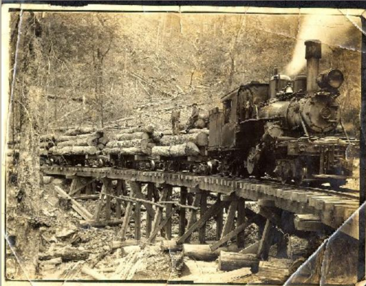
Montvale Lumber Logging Train; Eagle Creek (Swain County)