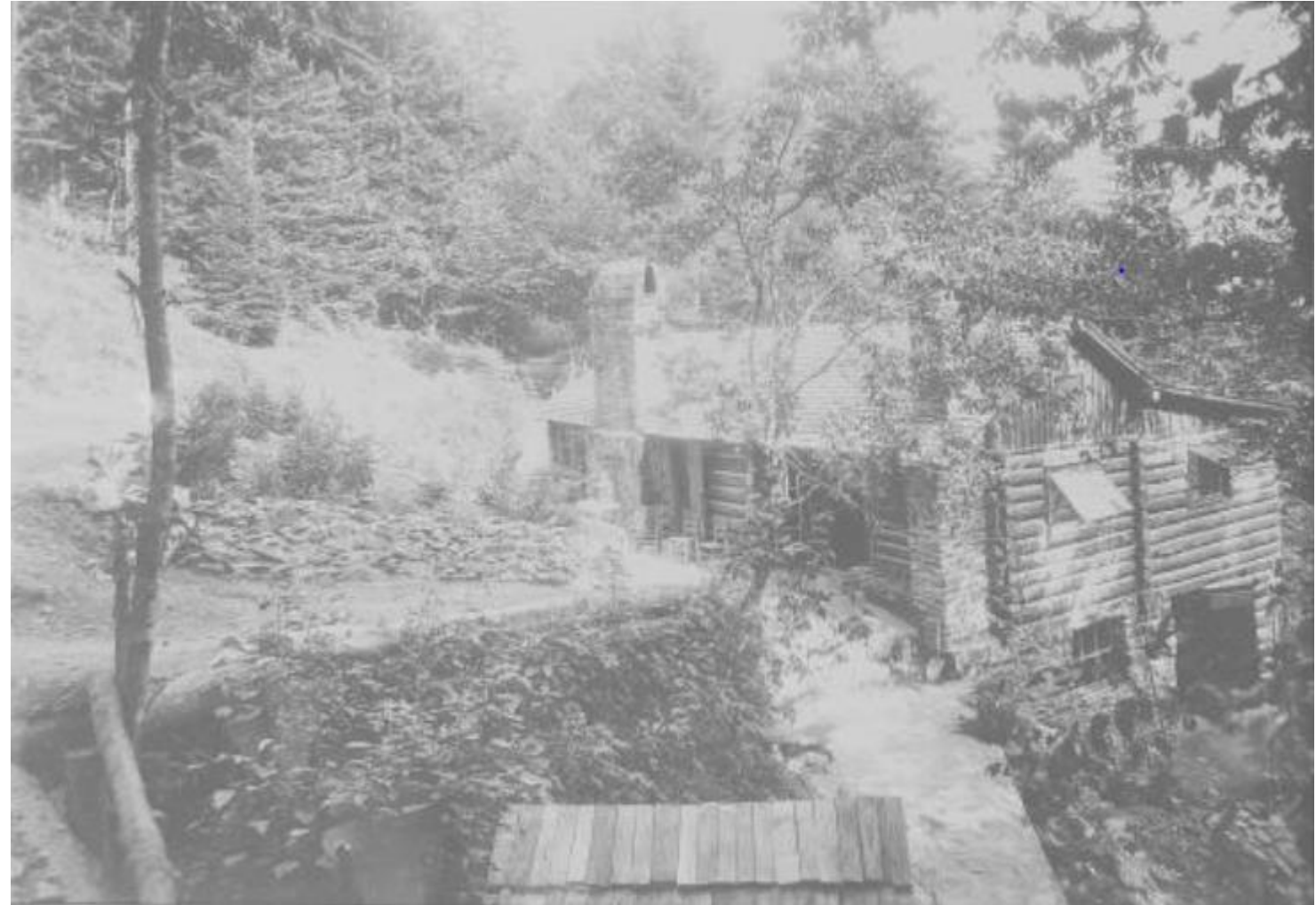
Timber Top Lodge at Indian Gap