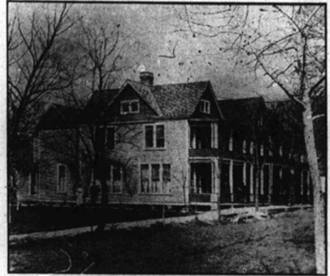
HOTEL ENTELLA, BRYSON CITY.