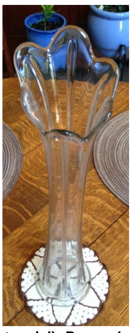
D.K. Collins store, on the southeast corner of the square (Bryson City Centennial); Pressed glass vase from the store purchased by Ora Hughes Dougherty