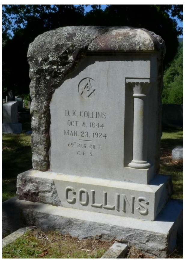
Grave marker for D.K. Collins