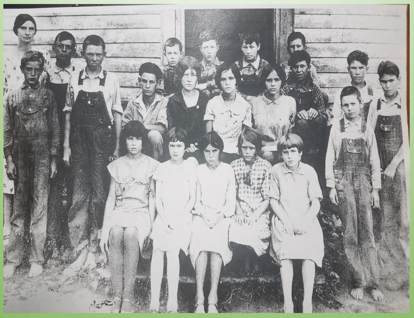
Maple Springs School pupils, circa 1927