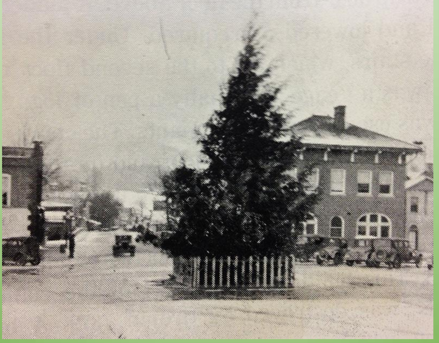
The Bryson City Christmas Tree, 1929